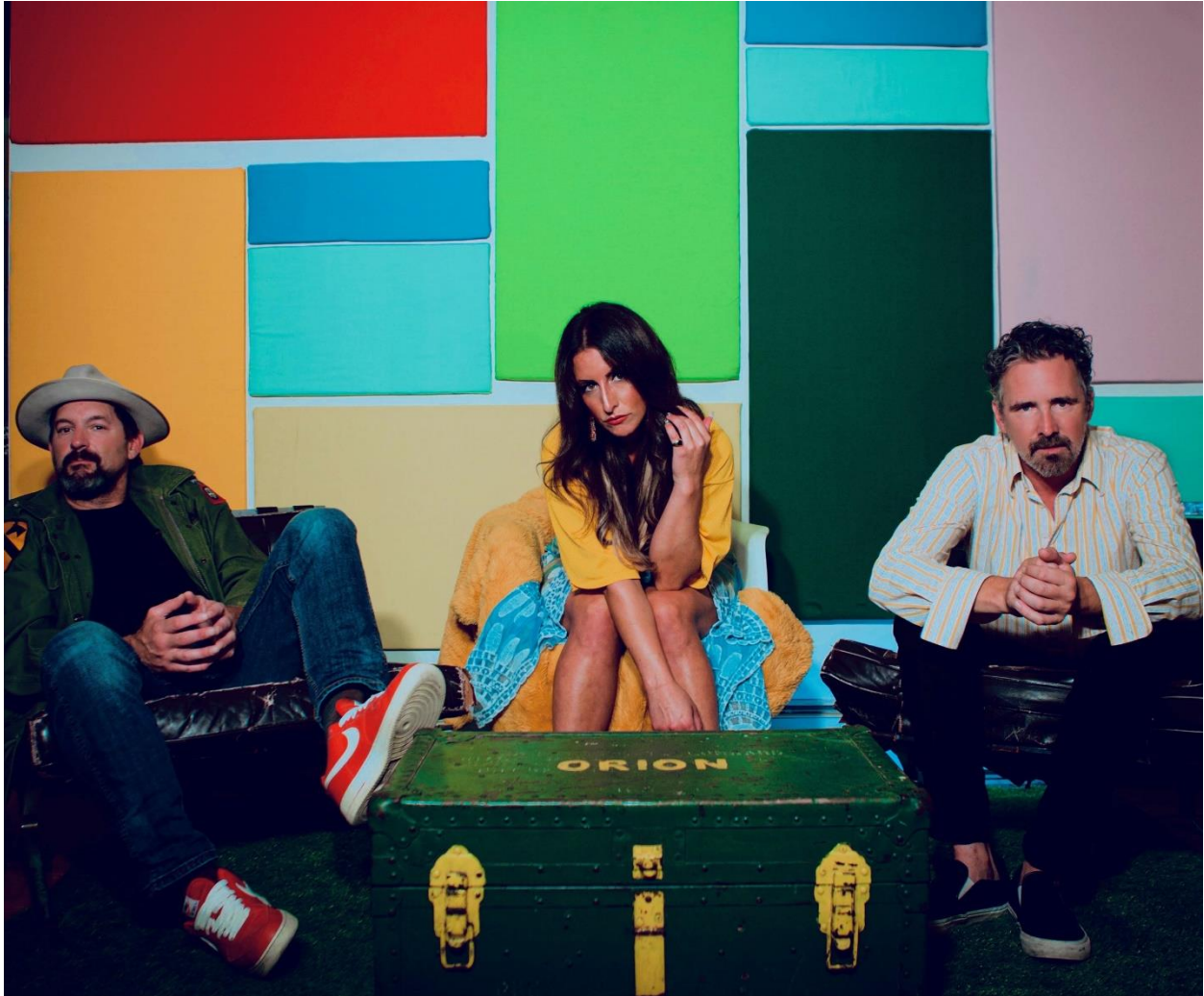
LOVE BY NUMB3RS

I keep tellin' myself I'm fine And whatever else just to ease my mind I'm just a human Mama, won't you love me for who I am Love me for who I am